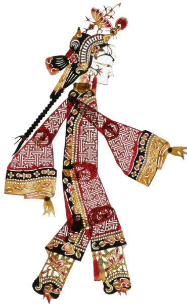
Figure 2 Chinese Shadow Play Character Modelling

Chinese shadow play is a traditional art form with a long history and rich cultural connotations. Due to its widespread in China, shadow play has formed different schools in the long-term evolution process of different regions, such as Shanxi shadow play, Longdong shadow play, Shaanxi shadow play, Hebei shadow play, etc. Each reflecting its unique style and characteristics. The Xiaoyi shadow play in Shanxi is one of the important branches of Chinese shadow play, named after its popularity in Xiaoyi City, Shanxi Province (Han, 2022). This section focuses on the character design characteristics of Xiaoyi shadow play. Character design is one of the core elements of shadow play, exquisite and delicate, and full of unique charm.