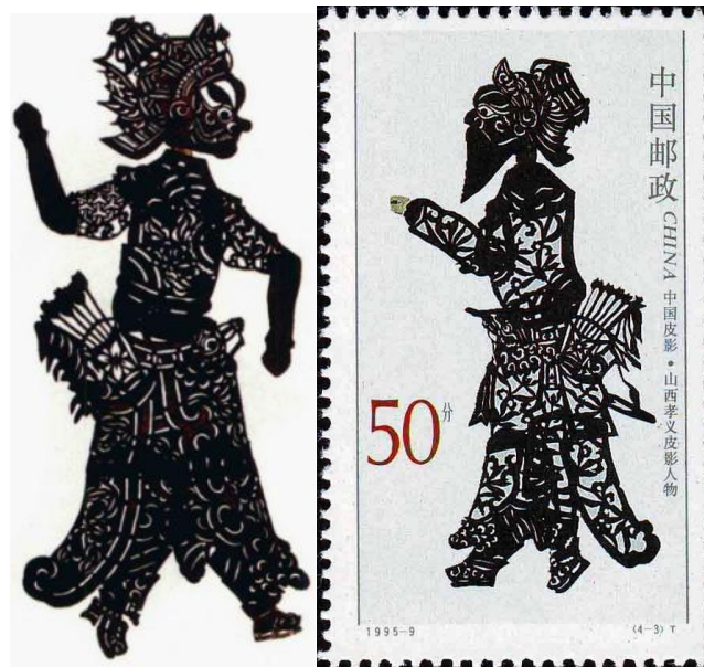
Figure 3 The Image of a Warrior in Xiaoyi Shadow Play (Han, 2022)

chaotic, simple but not sparse, with sharp knife techniques and concise colours. It is not affected by dramatization or facial makeup, and highlights the sincere temperament of ancient art. It has the charm of Han stone carvings, forming a unique form of beauty for paper window filmmakers.