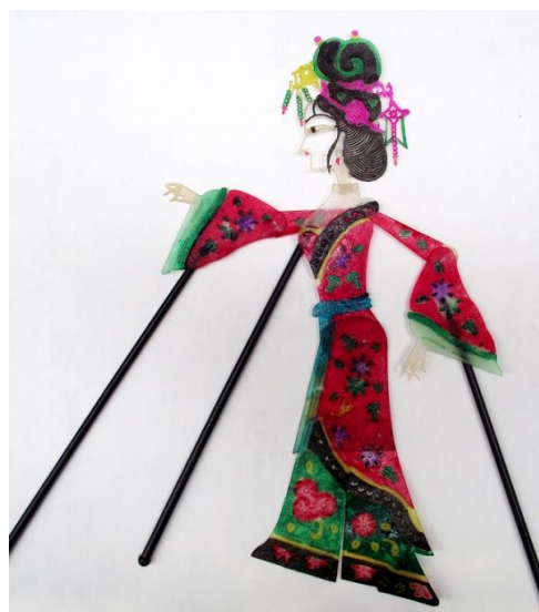
Figure 5 The Weaver Girl in The Cowherd and the Weaver Girl