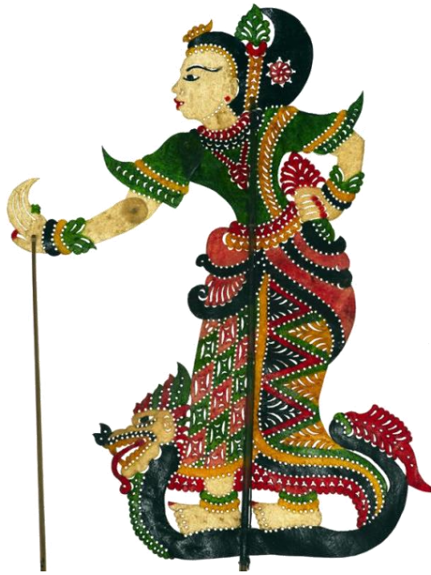
Figure 6 Sita Dewi/ Siti Dewi

The character design of Chinese shadow play consists of three joysticks, with Wayang Kulit's character having two joysticks, one arm fixed, and also carrying symbolic props or tools. The legs of Chinese shadow play characters are freely separated and flexible, while the legs of Wayang Kulit's character are fixed and have a certain degree of dragon shaped prop symbolizing identity. The hollowed-out patterns on the characters of the two countries are different, both with cultural characteristics and different costumes. Chinese character modeling costumes are generally similar to those in traditional Chinese opera.