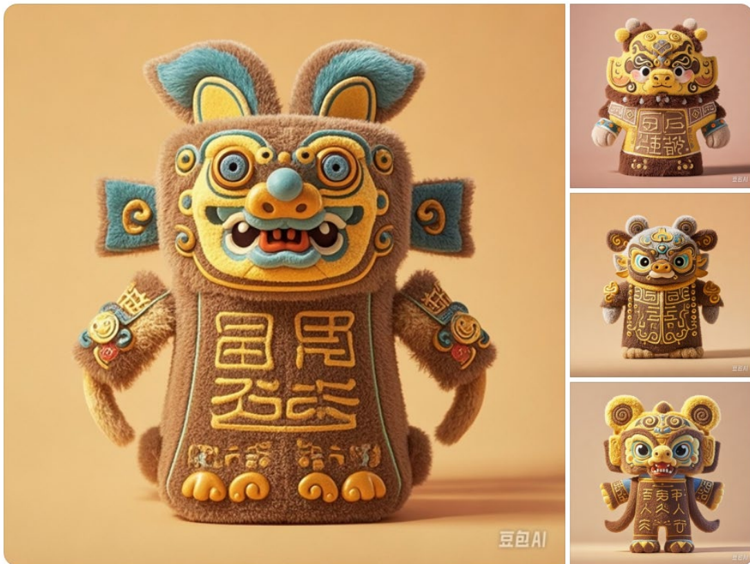
Figure 3: AI-Generated Image (Author's own work, generated with Doubao AI)