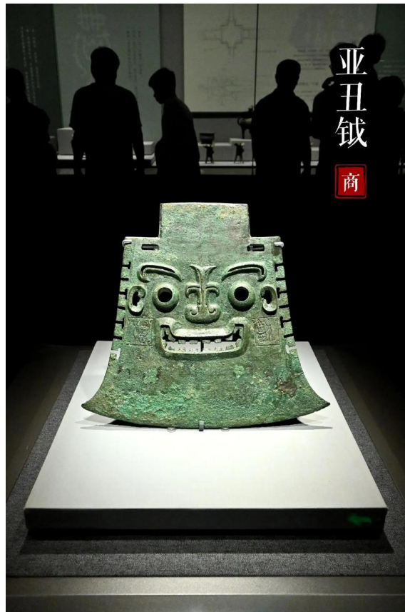
Figure 1: Ya Chou Yue

The Ya Chou Yue has a distinctive appearance, with openwork carvings on both sides depicting human and animal faces. Its facial features are pronounced, with hook-shaped eyebrows, a beast-like nose, ring-shaped eyes, round ears, and a wide-open mouth with upturned corners, exposing sharp teeth that convey a sense of mystery and authority. The “Ya Chou” inscription appears four times on the weapon, with two corresponding sets on each side. The weapon’s purpose might have been as a battle axe, a punitive tool, or a symbol of authority. During the Shang and Zhou periods, bronze yues became symbols of military power and authority, as well as indicators of social status (Sun, 2006). The discovery of the Ya Chou Yue is of great significance for the study of Shang Dynasty history, culture, politics, and art. It is an outstanding representation of Shang Dynasty bronze craftsmanship, reflecting the advanced casting techniques and unique aesthetic concepts of the time. Its inscriptions provide crucial clues for investigating questions related to the ethnic groups and regional powers of the Shang period (Wang, 2018). Figure 1 shows the Ya Chou Yue.