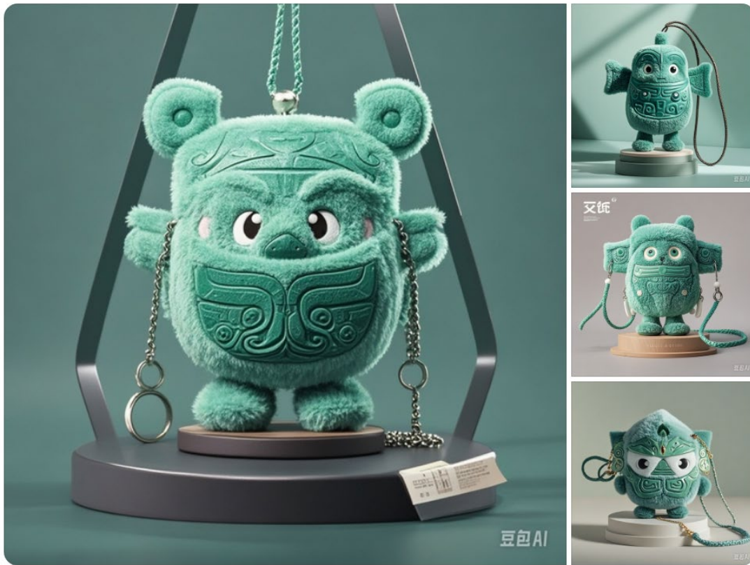
Figure 4: AI-Generated Image After Revising the Design Plan

(Author's own work, generated with Doubao AI)