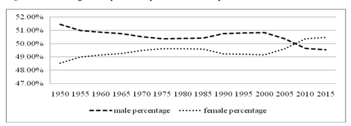
Figure 1. Percentage of Population by Gender in Malaysia

Figure 1 demonstrates the percentage of the population by gender in Malaysia from 1950 to 2015. The difference in the percentage of the female and male population has been marginal over the years. In the years 2010 and 2015, the female population recorded higher than that of male in Malaysia by 0.74% and 0.92%, respectively (World Population Review, 2015). Nevertheless, the female labour participation rate in Malaysia has historically been lower than the male's for the past 2 decades (Figure 2). As exhibited in Figure 2, there was 44.6% of the labour force participation rate of female in 1995 while the rate of male was 83.5%. In 2010, the labour force participation rate of female increased marginally to 45.5% while the male was 77.2%. In 2017, the difference between the male and female labour force participation rates had narrowed further to 24.2% from 31.7% in 2010.