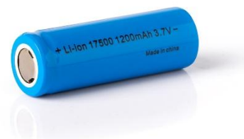
FIGURE 2. Lithium Ion Battery

where P is power, m is mass, v is velocity, and t is time. This calculation suggests a power need of approximately 5 kW battery to reach the desired performance. A lithium-ion battery, as shown in Figure 2, is rechargeable and efficient for this design. Moreover, this type of battery has a better lifespan compared to other types of battery.