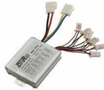
FIGURE 3. Brushed Motor Controller

Figure 3 shows a brushed motor controller. One of the biggest advantages of brushed DC motors is that they offer simple speed control without the need for complicated electronics. Instead, the speed is controlled using variable supply voltage. The voltage is applied proportionally to the rotational speed, while torque is proportional to the current. It is suitable for electric scooters, e-bikes, tricycles, minibikes, pocket bikes, go karts, all-terrain vehicles and mopeds.