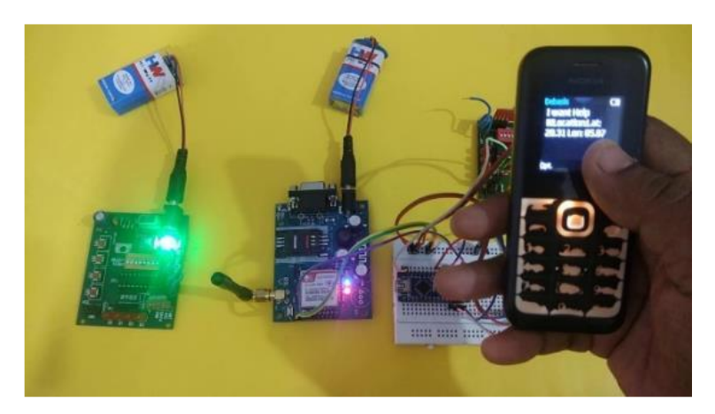
Figure 3. The Display of Alert Message

According to the results, the system makes it possible to quickly identify issues with user health and environmental circumstances, which promotes early action. Whilst SOS - emergency button and audio alarms offer quick means to express concern, the tactile feedback technique ensures enhanced situational awareness (See Figure 3). Furthermore, the ongoing GPS monitoring feature improves position awareness and allows for quick aid in an emergency. By drawing attention to the user's discomfort, the Nerve Stimulator's presence strengthens security even further. The Women Safety System with Nerve Stimulator has the ability to greatly enhance the protection of women by giving them with a proactive and dependable safety mechanism, as demonstrated by the project's overall results.